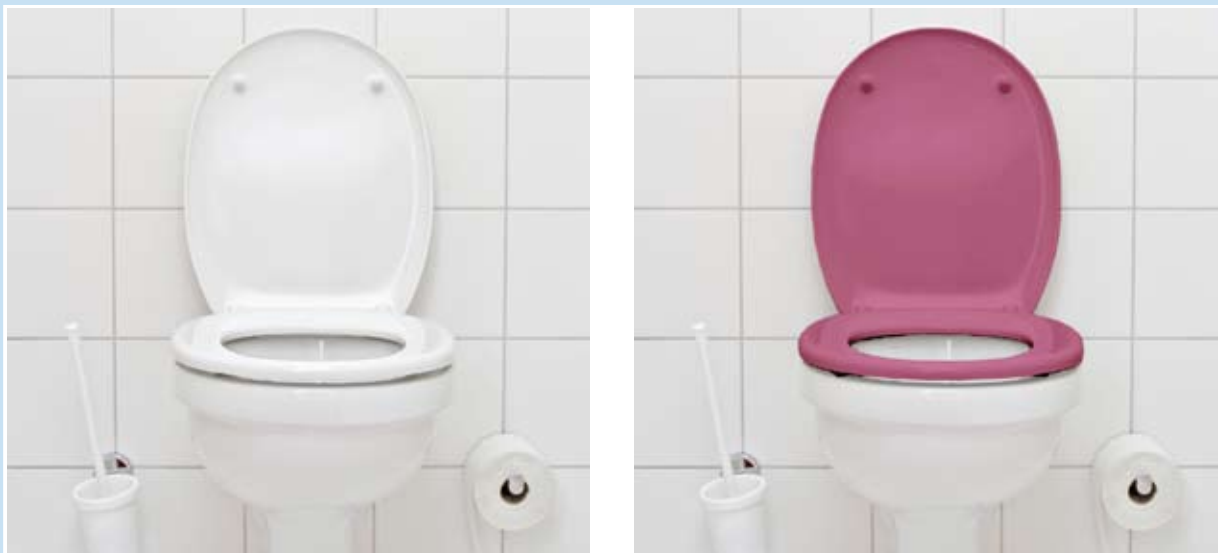
A toilet or bath may not be seen or used appropriately if the bathroom is white. Adding colour as shown here makes the toilet easier to see.

Leaving the toilet door open when not in use may be a reminder of the function of the room.