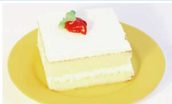
White food on a white plate may be difficult to see. A coloured plate can make a big difference.

Keep non-perishable finger food available around the house for snacks and nutrition between meals.