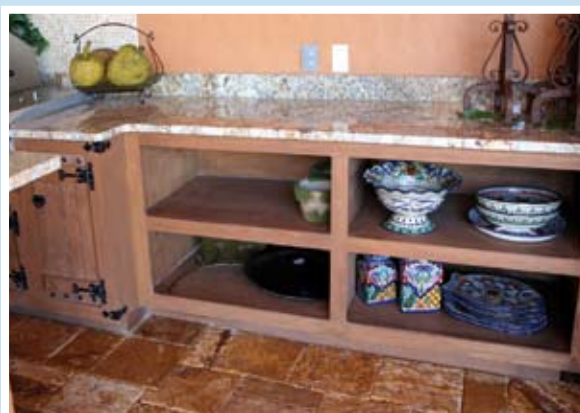
Using open shelves, removing cupboard doors or putting photographs on the outside to show what they contain can help in the kitchen.

Use a cup rather than a mug for drinking if this is what the person used when they were younger. Food needs to be appropriate for a person who has poor short term memory but maintains some long term memory. In earlier years they may not have eaten potato wedges for example, so will not recognise this kind of food now. Appliances must be meaningful, for example a person with dementia may not recognise pop up toasters, cookers, microwaves, or jug style kettles.