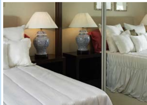
Mirrored doors on the wall or dressing table can cause confusion in a bedroom. A mirror at the end of a bed can have the same effect.

Try to give an element of independence to allow control over activities and actions for as long as possible.